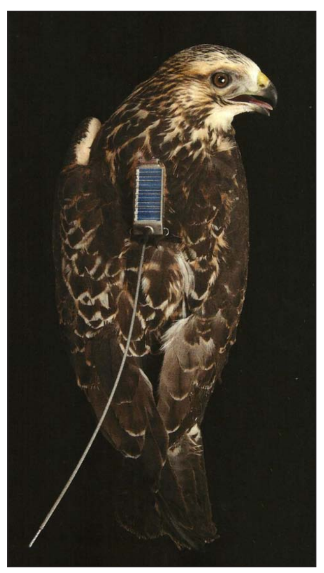
Customer Instructions/Notes for a Successful Deployment of North Star's PTTs