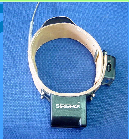
GPS/VHF collar with Sirtrack's Timed Release mechanism attached